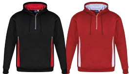
BLACK/ RED/ SILVER