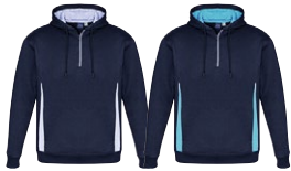
NAVY/ WHITE/ SILVER