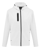
WHITE (LADIES ONLY)