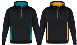
BLACK/ TEAL/ SILVER