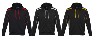
BLACK/RED BLACK/WHITE BLACK/GOLD

FEATURES Excellent fade and shrink resistance • Contrast shoulder panels and piping • Full front zipper with kangaroo pocket • Matching modern loose-fit hem ribbing • Kids style features no drawstring in hood - keeping kids safe