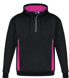
BLACK/ MAGENTA/ SILVER (ADULTS ONLY)