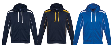
NAVY/WHITE NAVY/GOLD ROYAL/WHITE