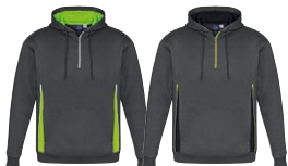
GREY/ FL. LIME/ SILVER