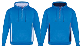
ROYAL/ WHITE/ SILVER