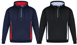
NAVY/ RED/ SILVER