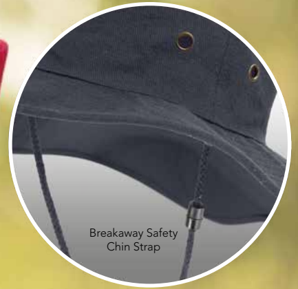
Breakaway Safety Chin Strap